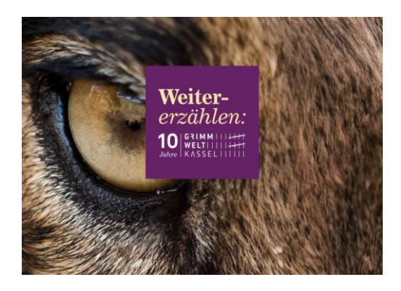
7: Anniversary campaign »Weitererzählen« | 10 Jahre GRIMMWELT & 20 Jahre UNESCO Weltdokumentenerbe