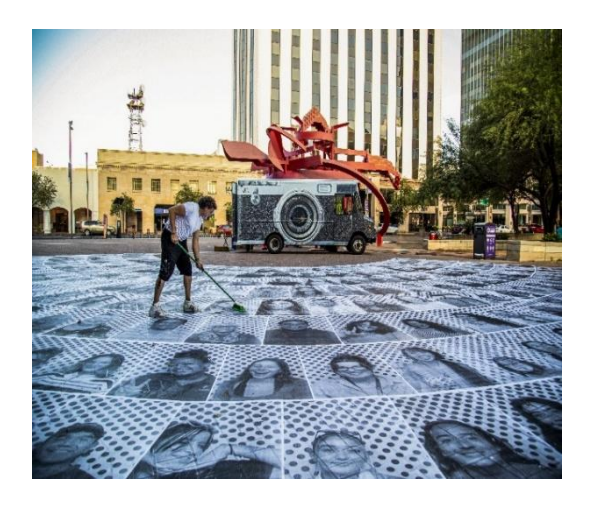
<u>5</u>: Inside Out Photobooth Action "11M," Photographer: Joshua Geyer, Tucson, Arizona, USA, 2021

September 4 - 6, 2025 | GRIMMWELT's Birthday Party »Inside Out Project-GRIMMWELT-Utopia «