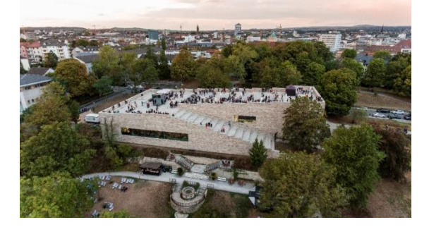
9: GRIMMWELT Kassel, © Y-Site