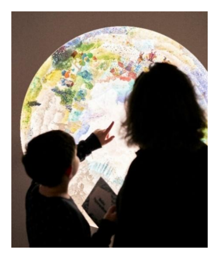
2: Alexej Tchernyi, Märchendichtung, 2024

August 23, 2025 to April 12, 2026 | Special Exhibition