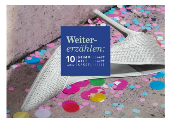
8: Anniversary campaign »Weitererzählen« | 10 Jahre GRIMMWELT & 20 Jahre UNESCO Weltdokumentenerbe