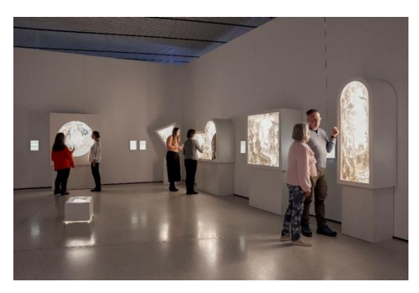
1: Alexej Tchernyi, Märchendichtung, 2024