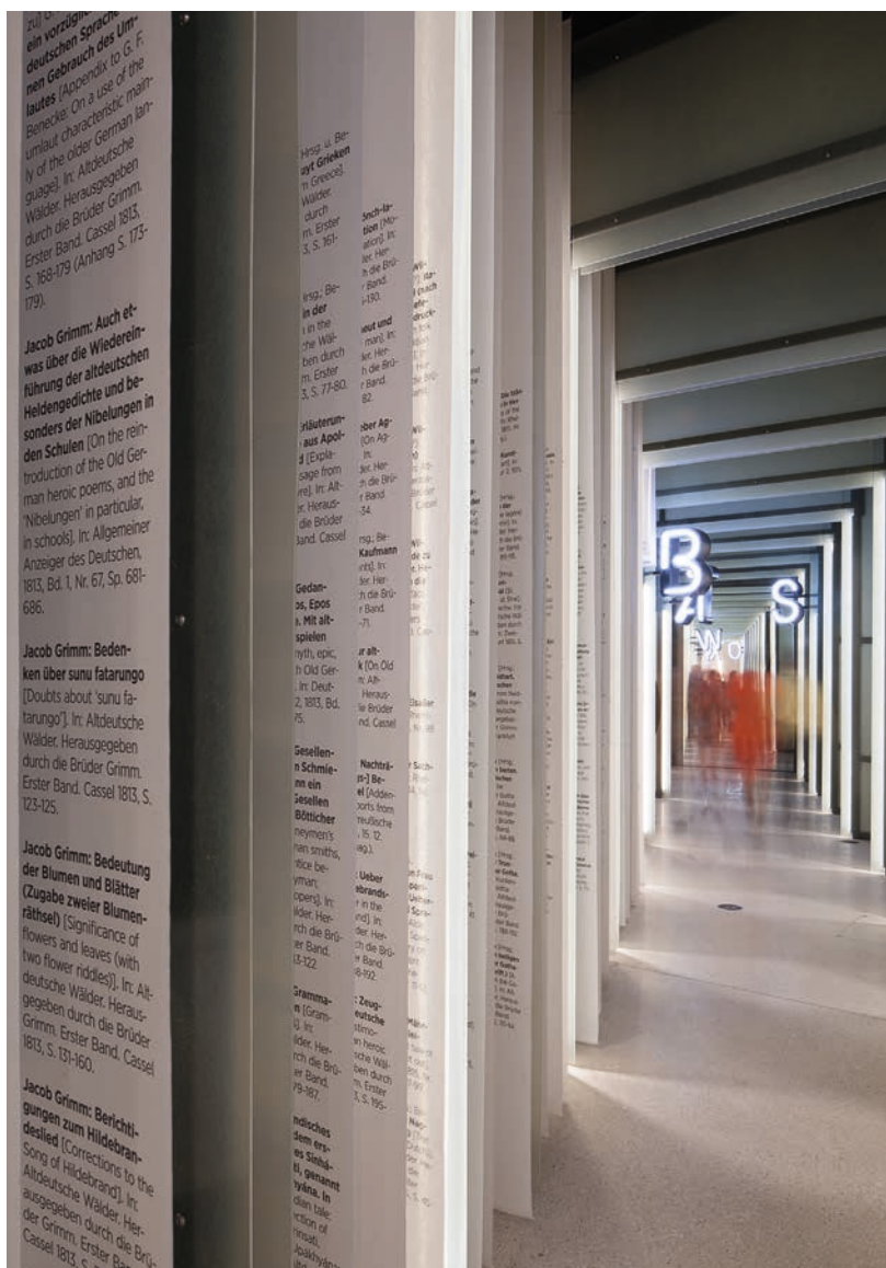
Walking through the “German dictionary”